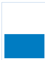
Half Page 7.5" X 4.875"