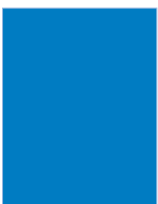
Full Page Bleed 8.5" X 11" + .125"