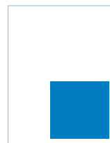
Third Page Island 4.9375" X 4.875"