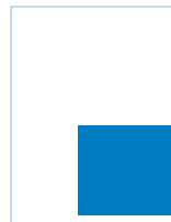
Third Page Island 4.9375" X 4.875"